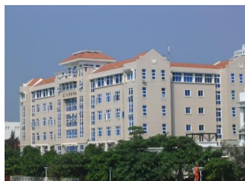
Zeng Cheng Kui Building

The workshop will take place in the Zeng Cheng Kui Building (Ocean Building)”, at College of Ocean & Earth Sciences, Xiamen University.